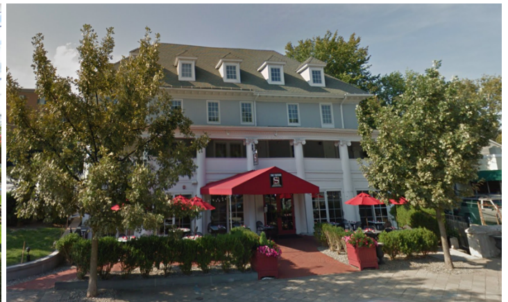
Figure 10: Existing buildings in downtown Bernardsville with attractive landscaping or active uses in interstitial spaces.