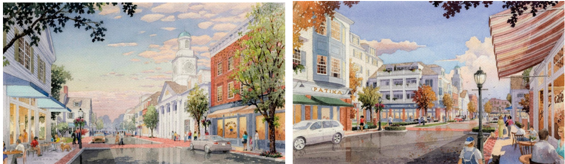
Figure 8: Renderings of proposed mixed-use buildings reflective of architectural styles envisioned by this Plan. 4