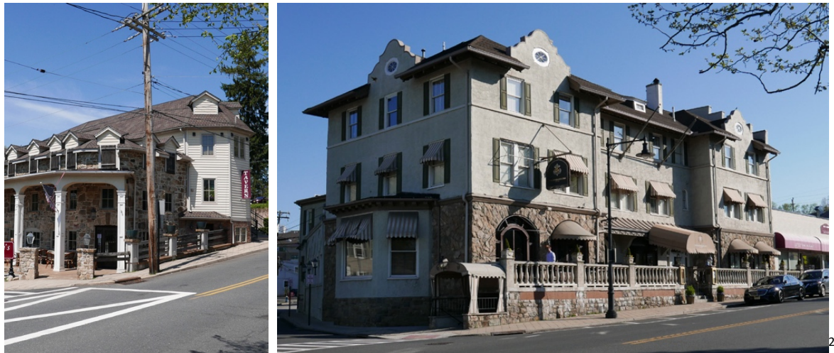
Figure 6: Buildings reflective of existing architectural character in downtown Bernardsville.

Construction within the Redevelopment Area should complement and contribute to the historic character of architecture in downtown Bernardsville. Building design standards shall apply to new construction in the Redevelopment Area.