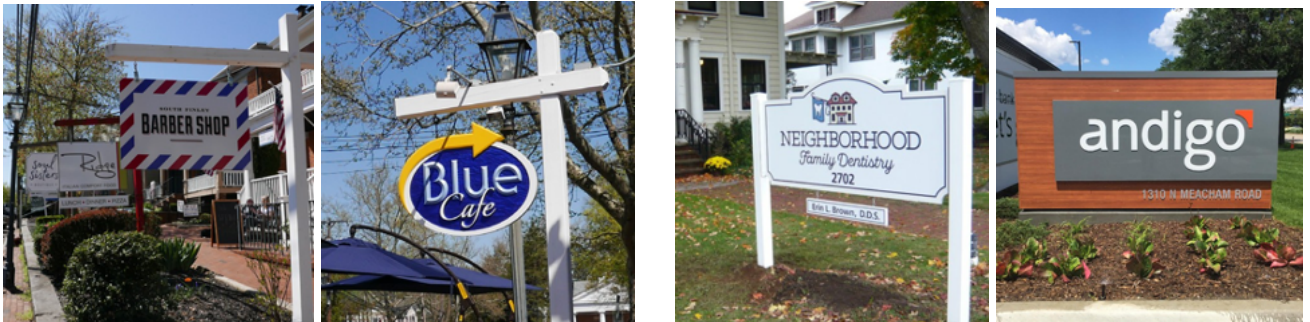
Figure 12: Sample small and large ground-mounted signs