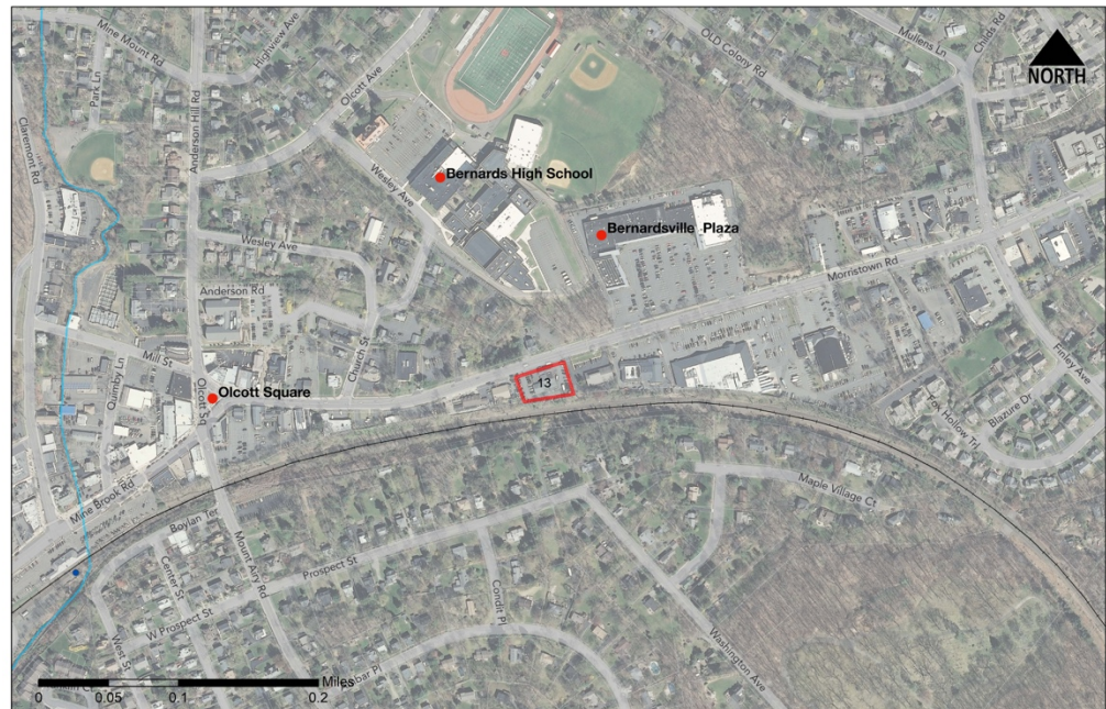
Figure 5: Morristown Road Redevelopment Plan Area and neighborhood context.

The site has connections to regional transportation via highway, bus, and rail, and as noted, an entry to I-287 is accessible roughly 1.5 miles from the site. Transit access is provided at the Train Station, which is serviced by the Gladstone Branch of NJ Transit and provides passenger rail service west to Gladstone and east to Summit, with Lakeland Bus Lines providing commuter bus service to and from the Port Authority Bus Terminal in Manhattan. The closest stop to the property is 0.1 miles to the east on Morristown Road.