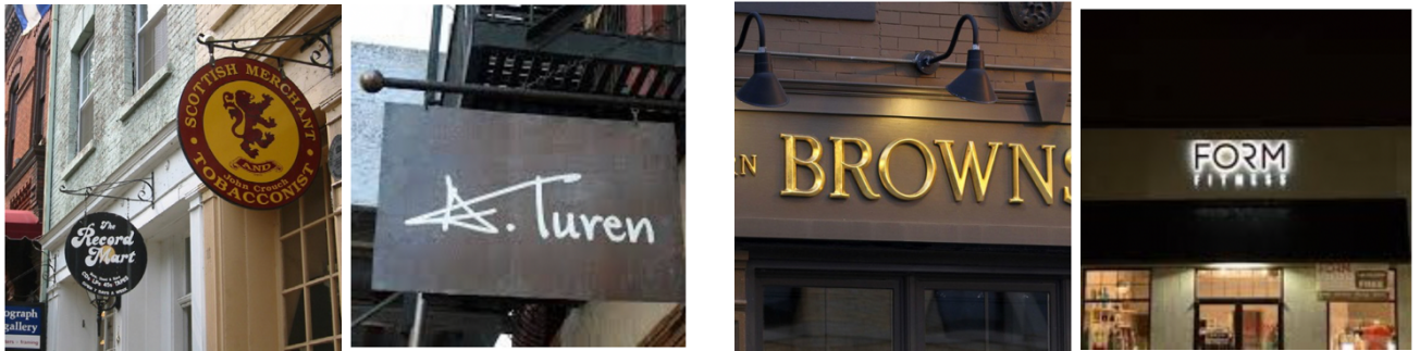
Figure 13: Sample projecting and wall signs.