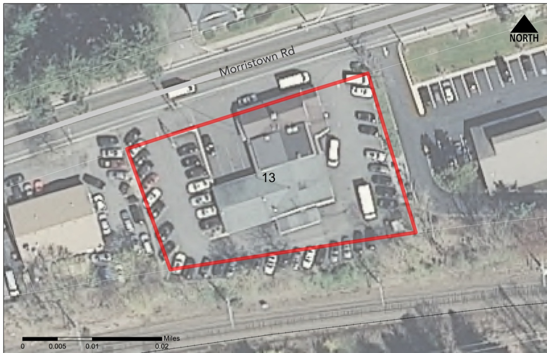
Figure 2: Area Subject to the Redevelopment Plan