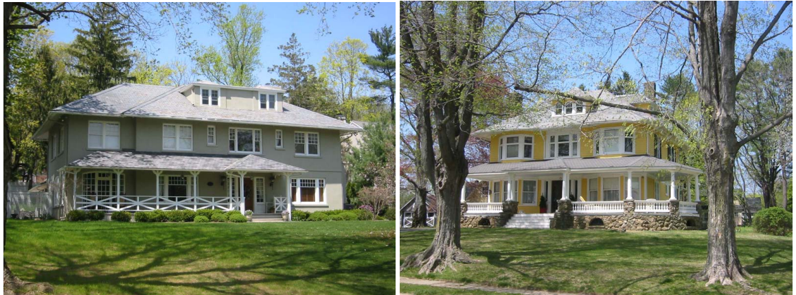
Figure 7: Buildings in the Olcott Avenue Historic District exhibiting features typical of Bernardsville architecture. 3