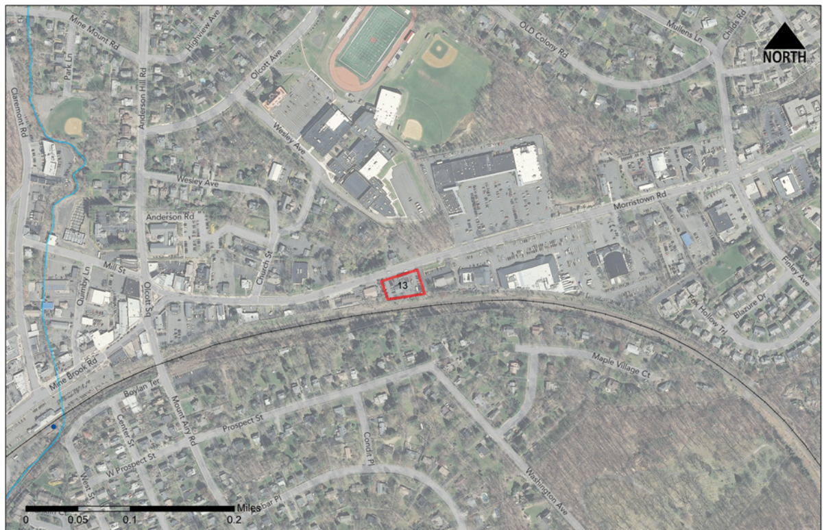
Figure 1: Redevelopment Area