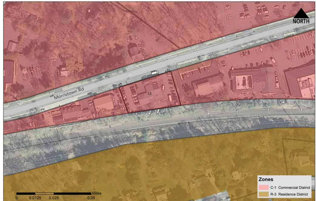
Figure 4: Existing zoning in and around the Redevelopment Area.

Parts of yards not used for parking shall be landscaped as required by the Planning Board, including special fencing or landscaping approved by the Planning Board to hide the property from residential zones. The maximum impervious coverage is 85%.