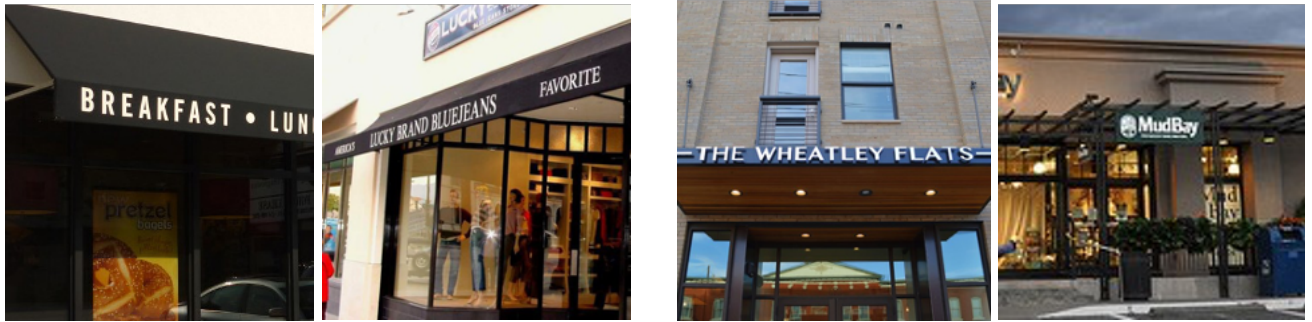
Figure 11: Sample awning and canopy signs.