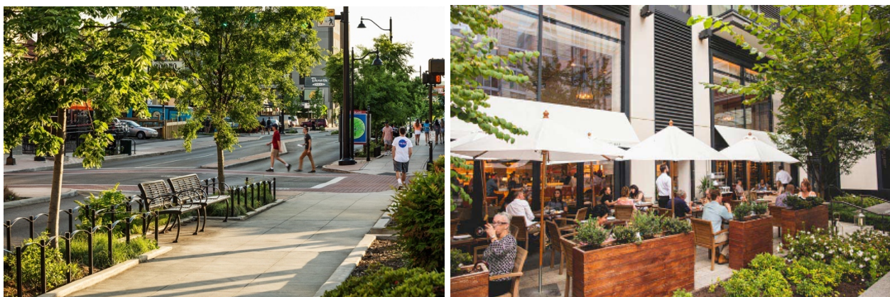
Figure 9: Streetscape with planting and pedestrian zones; parklets and outdoor dining to activate interstitial spaces.